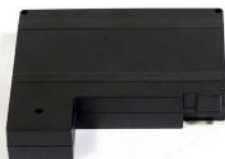
Battery 2 x included